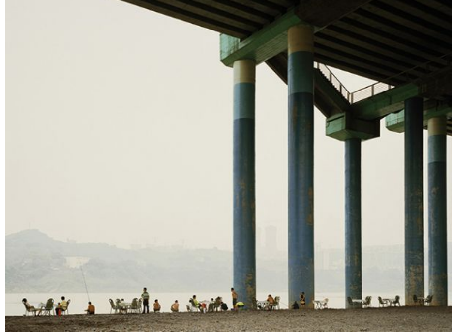
Nadav Kander, Chongqing VI (Sunday Afternoon), Chongqing Municipality, 2006 Chromogenic print, 117 x 149 cm (Edition of 3), 96.5 x 123 cm (Edition of 5), 77 x 98 cm (Edition of 5), Image courtesy of artist and Blindspot Gallery

10 May - 19 July 2014 at Blindspot Gallery, Hong Kong