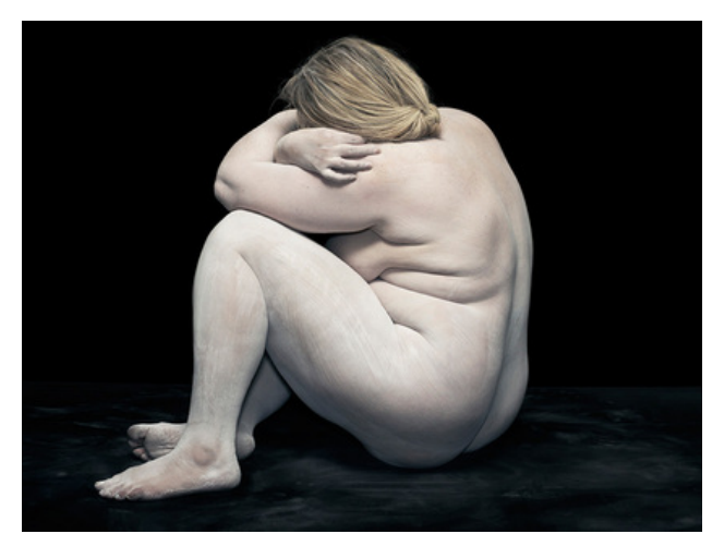
NADAV KANDER, Elizabeth Sitting, 2012, C-print, 135 x 180 cm, Courtesy the artist and Blindspot Gallery, Hong Kong.

insignificant and vulnerable people can be in China's era of change.