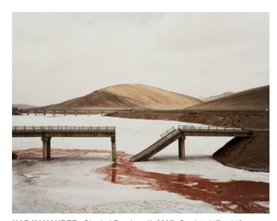
NADAV KANDER, Qinghai Province II, 2007, C-print, 117 x 149 cm.