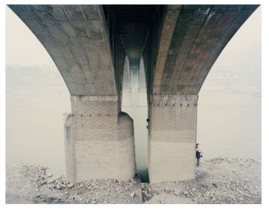
NADAV KANDER, Yibin VII, Sichuan Province, 2007, C-print, 117 x 149 cm. Courtesy the artist and Blindspot Gallery, Hong Kong.

Blindspot Gallery, viewers first encounter Chongqing IV (Sunday Picnic), Chongqing Municipality (2006), in which five presumably Chinese citizens are enjoying a "picnic" under a bridge by the Yangtze River. The small-sized figures are pressed against large and tall bridge pillars, and the misty river in the background contrasts with the sharp focus of the people in the foreground. One participant's uneasy stare seems to convey people's powerlessness and discomfort associated with the rapid and dramatic change happening alongside the Yangtze River. Another photograph, Yibin I (Bathers), Sichuan Province (2007), captures a group of halfnaked men standing on a large rock next to the Yangtze River. Standing with their hands at their waists and backs against the lens, the bathers stare at the other side of the river bank. Across the river is a factory sitting in the misty background, with smoke coming out of its chimney. Again, the body gestures of the figures suggest a sense of powerlessness that people feel in response to the uncertain future brought by extensive development.