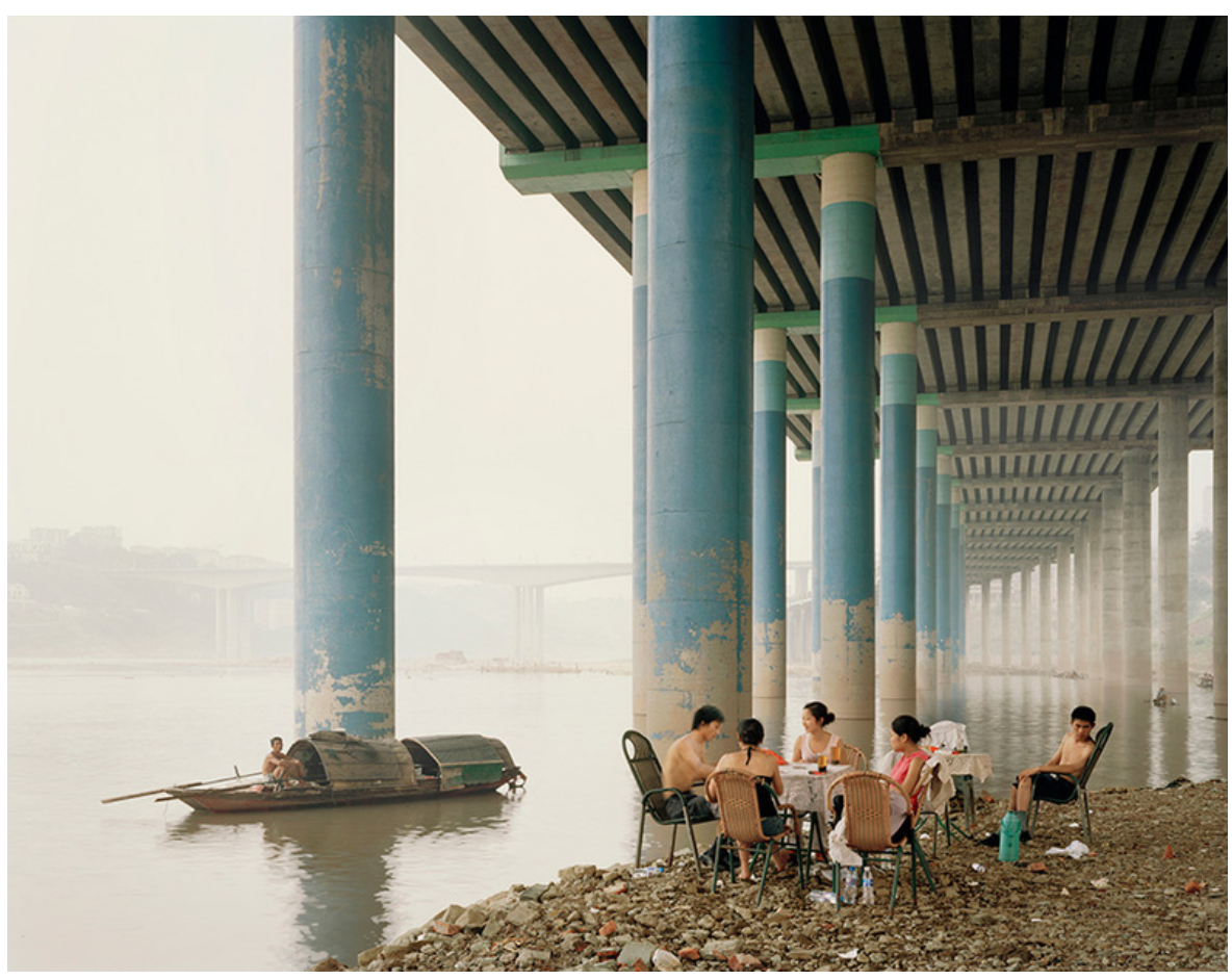
Nadav Kander, Chongqing IV (Sunday Picnic), Chongqing Municipality, 2006, C-print, 117 x 149 cm.

Blindspot Gallery, viewers first encounter Chongqing IV (Sunday Picnic), Chongqing Municipality (2006), in which five presumably Chinese citizens are enjoying a "picnic" under a bridge by the Yangtze River. The small-sized figures are pressed against large and tall bridge pillars, and the misty river in the background contrasts with the sharp focus of the people in the foreground. One participant's uneasy stare seems to convey people's powerlessness and discomfort associated with the rapid and dramatic change happening alongside the Yangtze River. Another photograph, Yibin I (Bathers), Sichuan Province (2007), captures a group of halfnaked men standing on a large rock next to the Yangtze River. Standing with their hands at their waists and backs against the lens, the bathers stare at the other side of the river bank. Across the river is a factory sitting in the misty background, with smoke coming out of its chimney. Again, the body gestures of the figures suggest a sense of powerlessness that people feel in response to the uncertain future brought by extensive development.